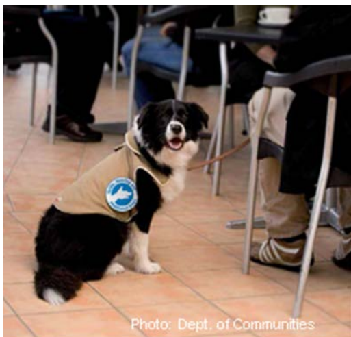
Figure 3. Certified support dogs wearing an identifying coat or harness with approved badge or tag.