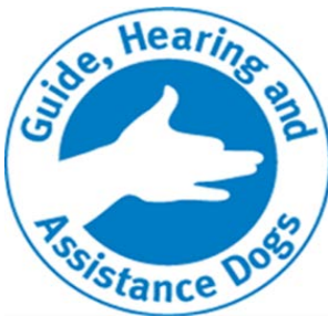
Figure 2. Approved QLD Guide Hearing and Assistance Dog Act identifying badge