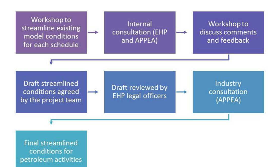
Figure 1. Process followed by the project team to streamline the existing petroleum model conditions.