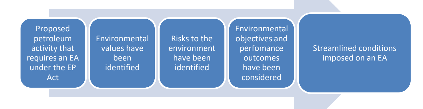
Figure 2. Overview of key considerations when imposing streamlined conditions on an EA

When determining the appropriate conditions to impose on an EA, the administering authority must consider certain criteria, including sections 207, 208, 209 of the EP Act and sections 52 and 53 of the EP Reg. The head of power for the administering authority to impose conditions may include one or more of the criteria listed above. The head of power is listed in the explanatory notes for each condition in Appendix 1.