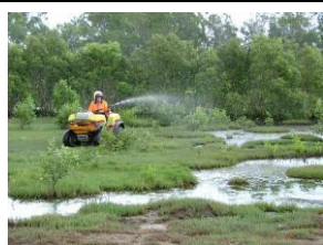
Operator care is required in sensitive habitats.

To minimise environmental impacts through the training and awareness of personnel involved in mosquito management.