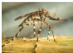
Aedes alternans (scotch grey)

very difficult to detect using conventional sampling techniques, but the adult mosquitoes of these species can sometimes be significant and abundant pests.