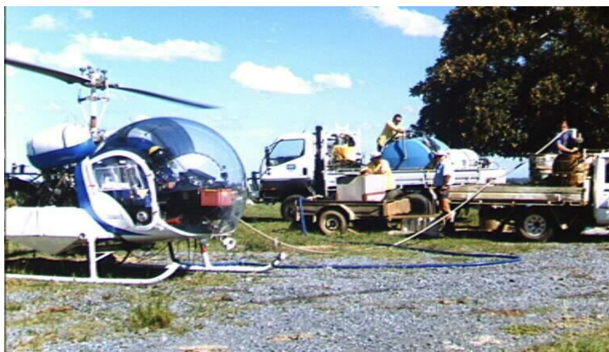
Reloading and refuelling as part of an aerial larviciding operation