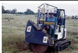
K3 runnelling machine used by Redland City Council

Objective: To reduce mosquito breeding in selected areas of saltmarsh through runnelling and to facilitate improving access to treated sites by natural predators of mosquito larvae and pupae.