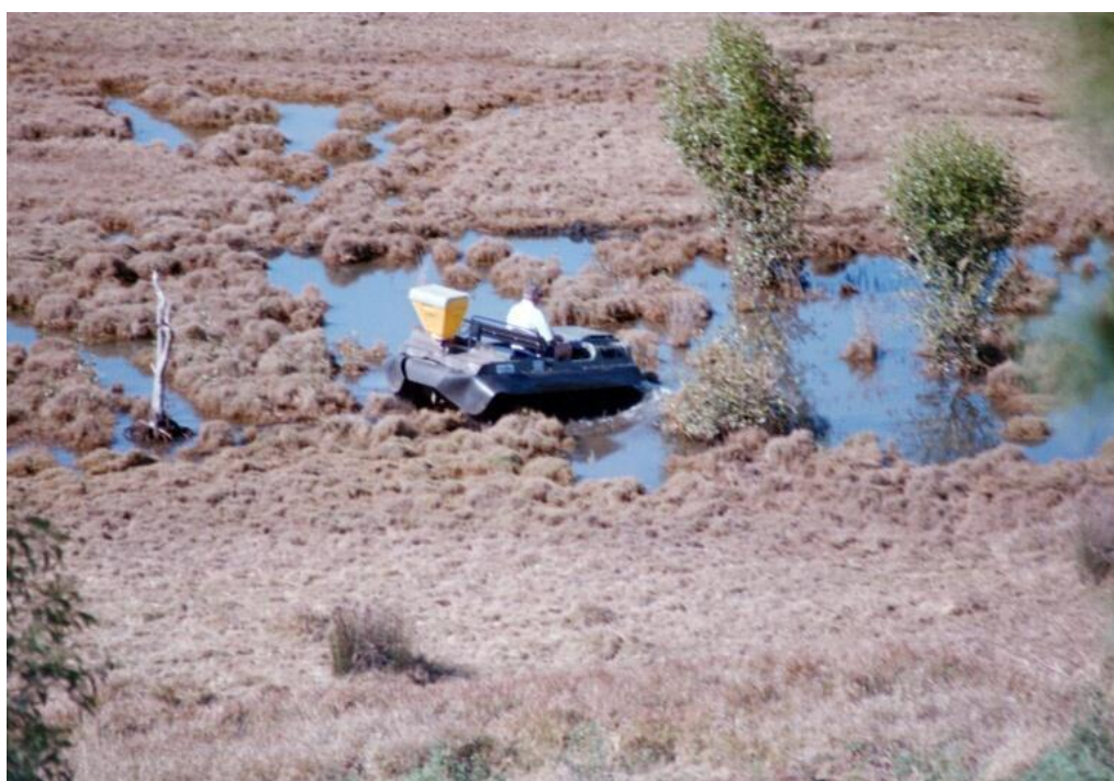
Landbased larviciding operation in saltmarsh