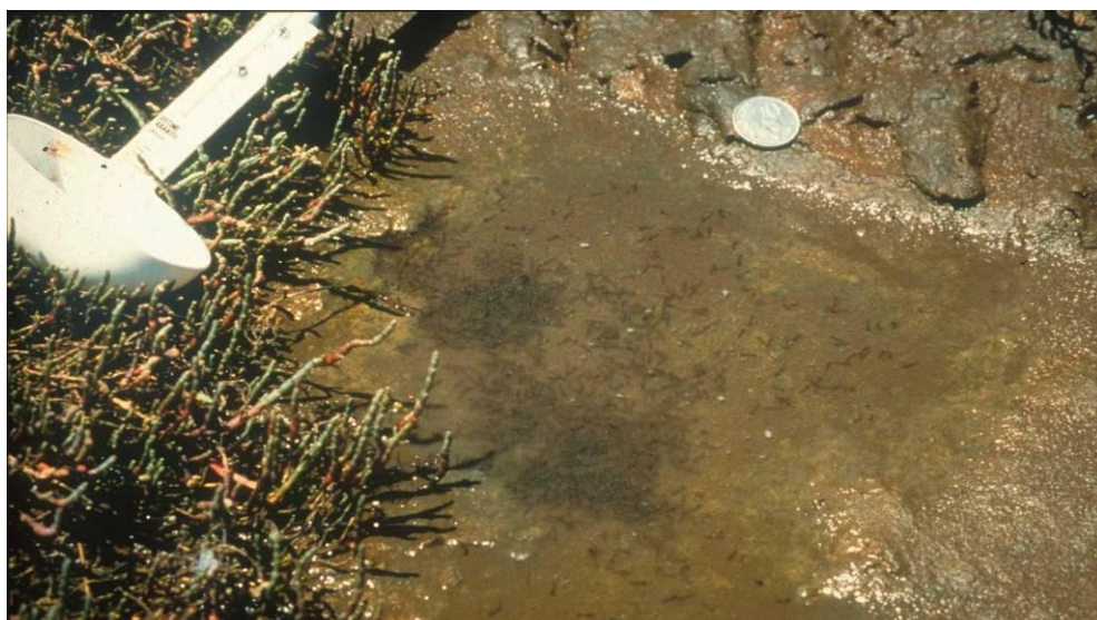
Mosquito larvae in a rapidly drying saltmarsh pool

Eggs hatch to produce larvae (wigglers), which grow through four "size" steps (called instars) before becoming pupae (tumblers). The larvae feed on micro-organisms in the water and most species breathe through a tube in the tail which opens to the air as the larvae come to the surface of the water. Pupae do not feed, and breathe through a pair of tubes on the top of the body as they rest at the water surface.