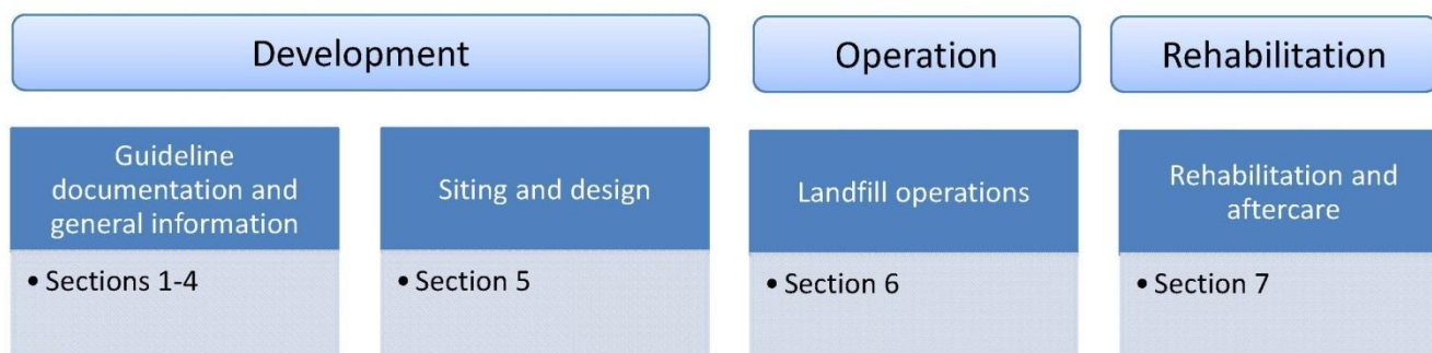
Figure 1: Structure of this guideline

This document sets the outcomes to be achieved for each of the above phases and provides guidance on suggested measures that could be used as part of the strategy to meet the required outcomes.